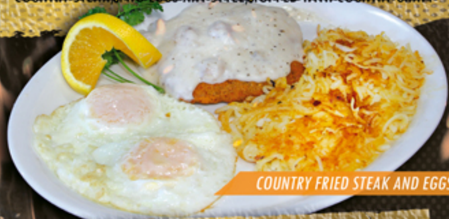
COUNTRY FRIED STEAK AND EGGS

COUNTRY FRIED STEAK & EGGS $16 COUNTRY STEAK, TWO EGGS ANY STYLE, TOPPED WITH COUNTRY GRAVY