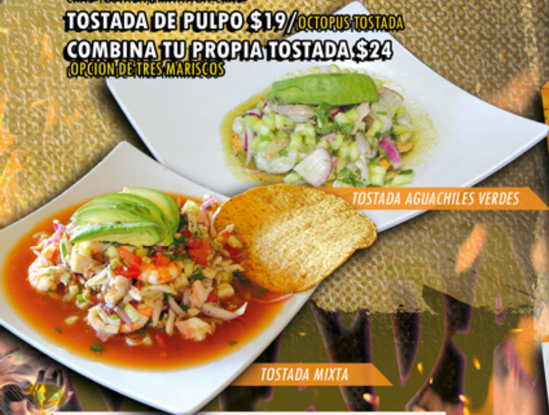
TOSTADA AGUACHILES VERDES