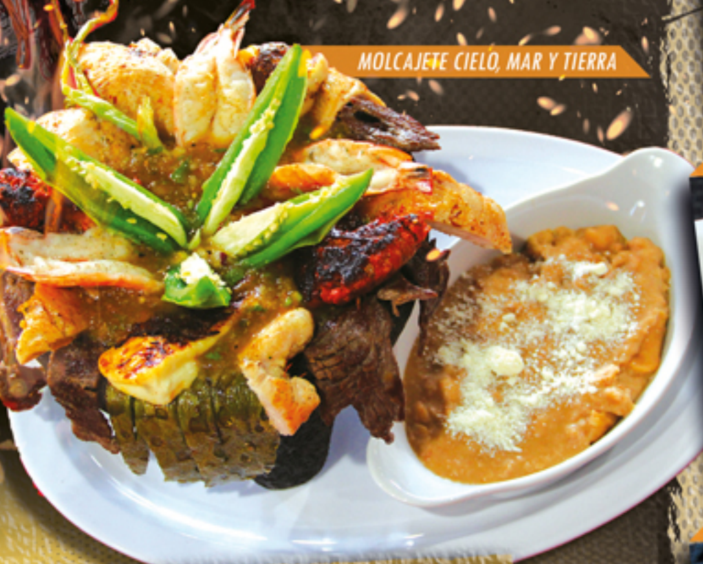
MOLCAJETE CIELO, MAR Y TIERRA