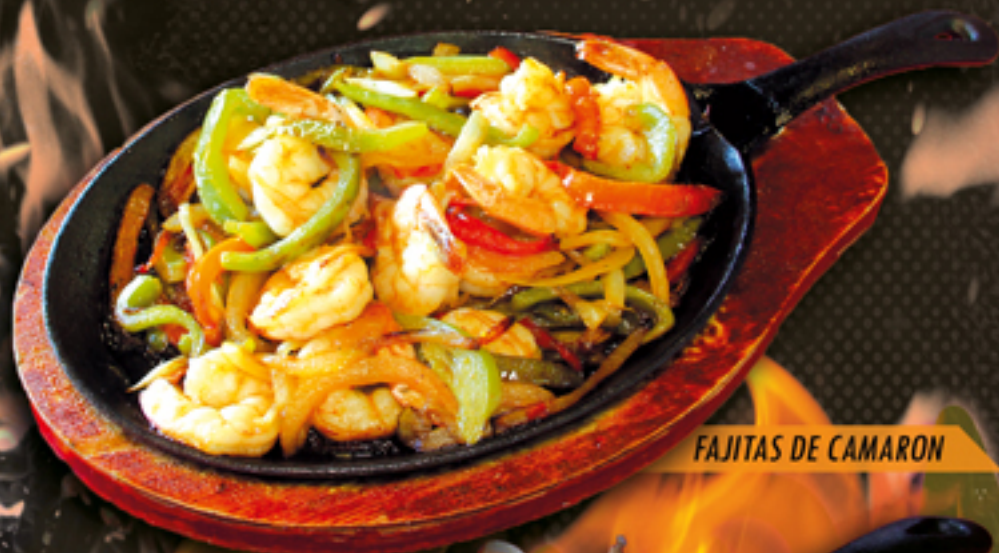
FAJITAS DE CAMARON