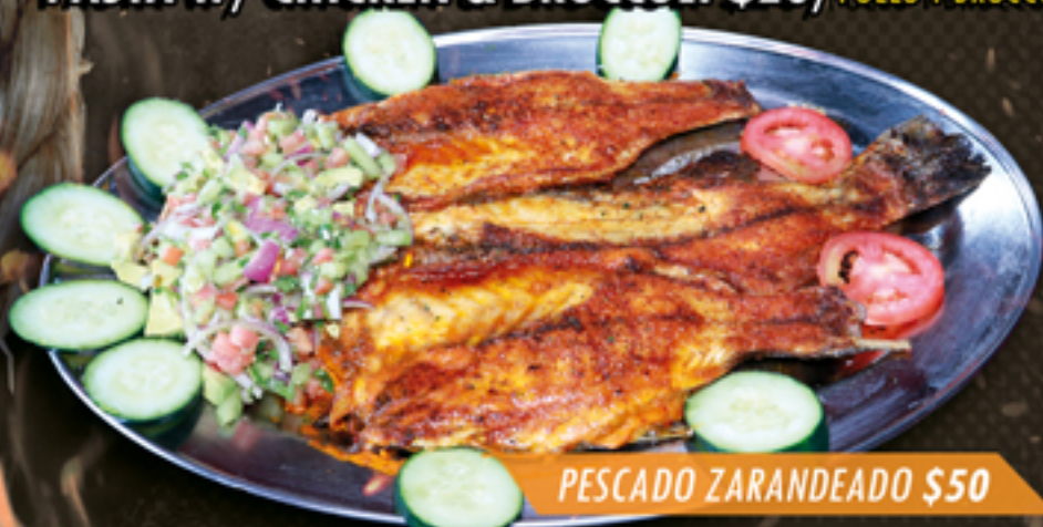
PESCADO ZARANDEADO $50

PASTA W/ CHICKEN & BROCCOLI $20 / POLLO Y BROCCOLI