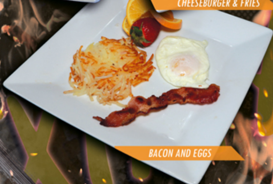
BACON AND EGGS