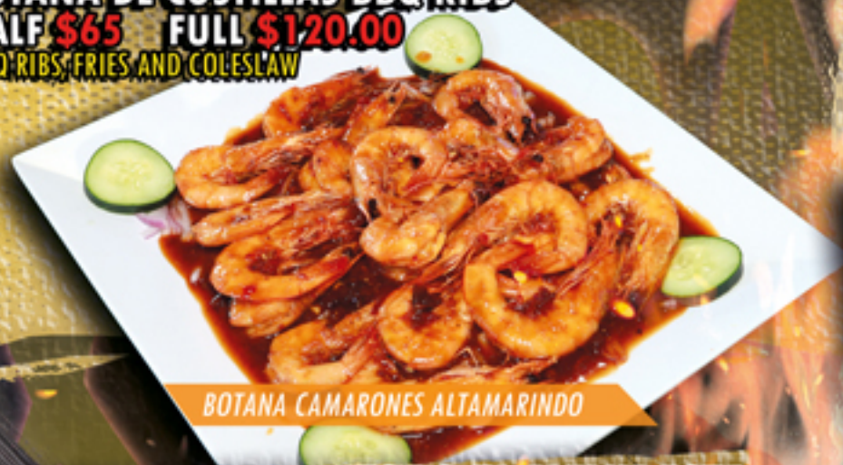
BOTANA CAMARONES ALTAMARINDO

TODO EL MENU ESTA DISPONIBLE PARA LLEVAR!!