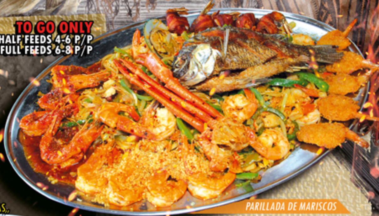
PARILLADA DE MARISCOS

CAMARONES, JAIVA, MOJARRA, PATAS DE JAIVA, CAMARONES EMPANIZADOS, MEJILLONES, CAMARONES COSTA AZUL, BABY CLAMS, ABULONE, PULPO, CAMARONES AL MOJO DE AJO, CAMARONES CON CABEZA, FAJITA VEGETABLES AND TORTILLAS