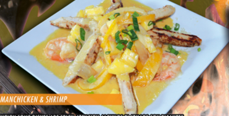
MANCHICKEN & SHRIMP

MANCHICKEN & SHRIMP $21 CHICKEN & SHRIMP WITH MANGO OVER RICE