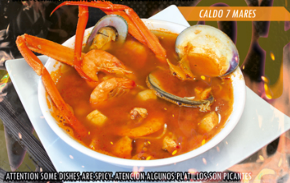
CALDO 7 MARES

ATTENTION SOME DISHES ARE SPICY. ATENCION ALGUNOS PLATILLOS SON PICANTES