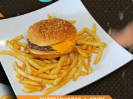
CHEESEBURGER & FRIES